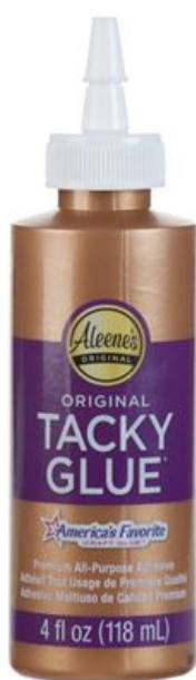
Aleenes® Original Tacky Glue®